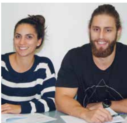
Centre for Office Productivity » P.17-25