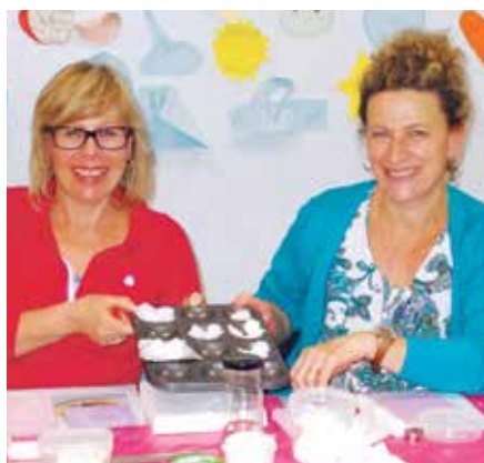
Nepean Community College » P.5-15