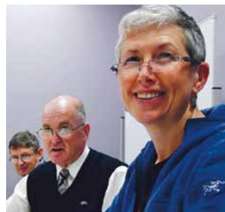
Centre for Social Inclusion » P.26-29